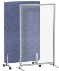
Sector & Motif: Freestanding