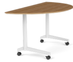
Parallon: Half Round